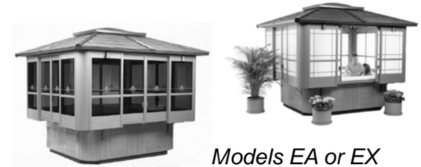
Models EA or EX